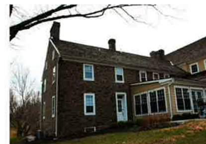
Main block of house (rear view)