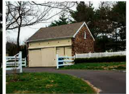
Front elevation Barn / wagon house front view