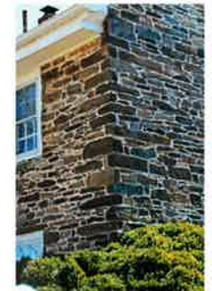
Detail of quoins