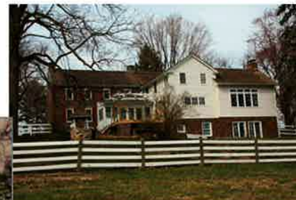
House rear elevation