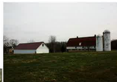
Wood frame barn & dairy barn with silos