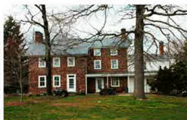
House (front elevation)

Materials Walls Stone Year Built c. 1790