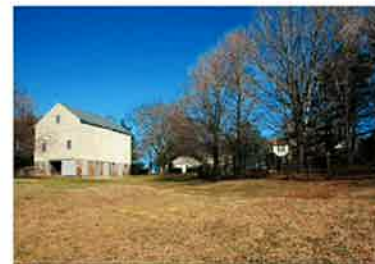
Outbuildings and house (right)