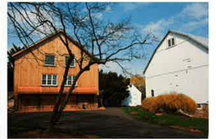
Barn & silo