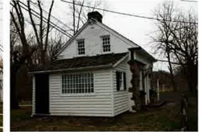
Side view with addition

Notes: Stone with stucco on one gable wall, 1.5 story, 3 bay, single pile, one stone interior end chimney, wood shingle gable roof, wide frieze board on front elevation, 6/6 windows, pedimented front entry, 1 bay, single story, shed roof, frame addition off of left gable end, large multi-paned window and side entry; small shed roof, utility shed addition to rear.