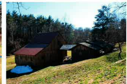
Barn and Stable (rear view)