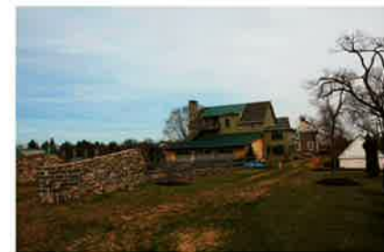
Remains of barn with new outbuilding & house beyond