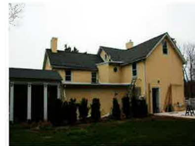
House rear view