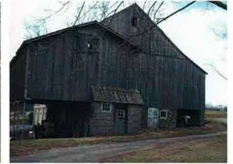
Barn (photo from 2008)

Notes: Stone & stucco, 2.5 story, 7 bay, single pile, 1 stone interior chimney, 1 brick interior chimney, gable roof, 9/6 first floor windows, 6/6 second floor windows, large oval datestone reads "1819", 4 light transom over all 4 doors, south side doors have federal detailing, porch extends along one side, stone shed roof addition, 3 gable roof dormers on one roof slope.