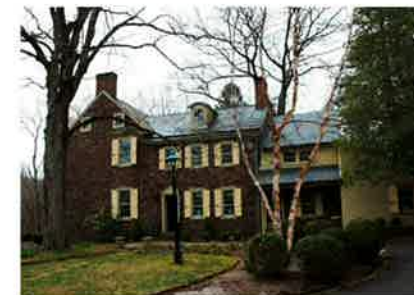
Side view with additions