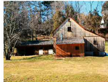
Barn and Stable (street facing elevation)