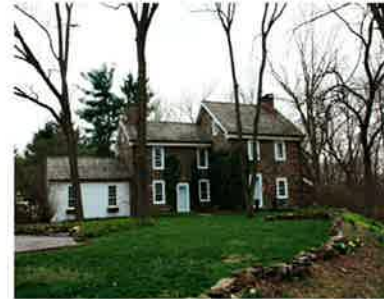
View from driveway

County Bucks Municipality Upper Makefield Photo # 4 Tax Parcel # 47010009 Address / Location 1298 Taylorsville Rd. Resource Name "John Knowles House" National Register Status Significant early date Historic District Ranking 1 Past Use Farm Current Use Residential Main Resource House Materials Walls Stone Year Built c. 1725 Architectural Style Vernacular