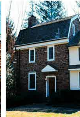
View of main block