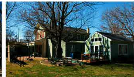
Rear view with modern additions