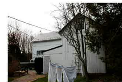
View of barn from house