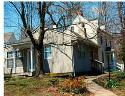
House with addition