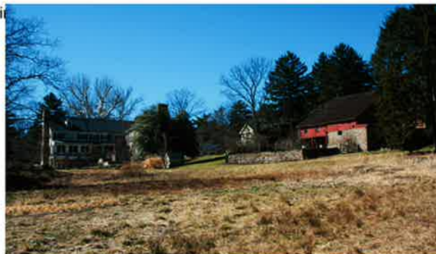
Barn and house