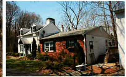
View of addition & main block

Notes: Stone & stucco construction, 2.5 story, 3 bay, single pile, 1 stone interior end chimney (r), gable roof, 2 gable front dormers, 6/6 windows; brick addition to side, 2.5 bay, single story, gable roof; stucco addition along street facing side, 4 bay, shallow pitched gable roof, oriented perpendicularly to main block, shed roof porch on rear, replacement windows.