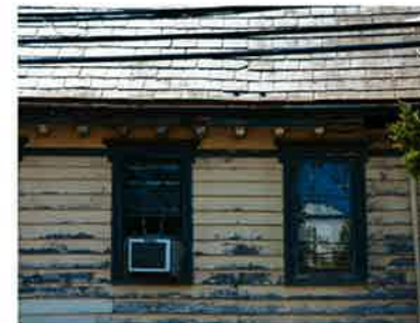
Detail of cornice and windows