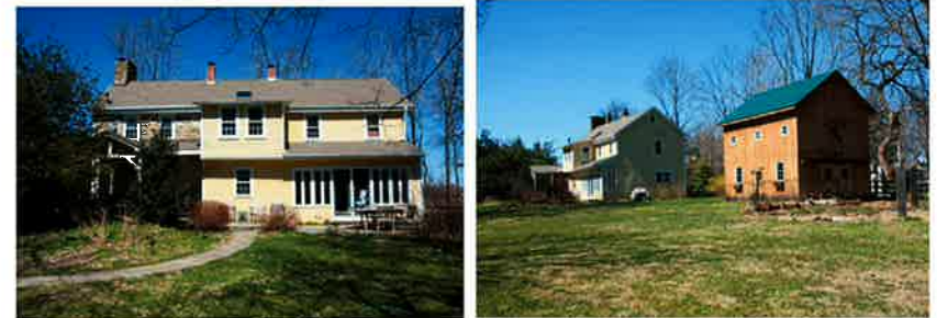
Front elevation (cabin section on l)

Historical Notes: Probable home of Whitson Canby, Dolington's developer