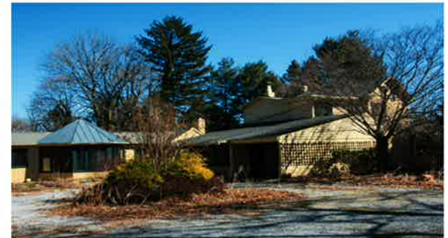
Driveway side of house & additions