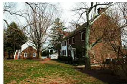
House & garage

Architectural Style Vernacular Materials Walls Stone Year Built 1810