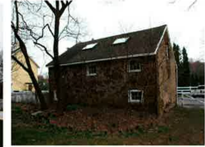
Barn rear view (with house in background)