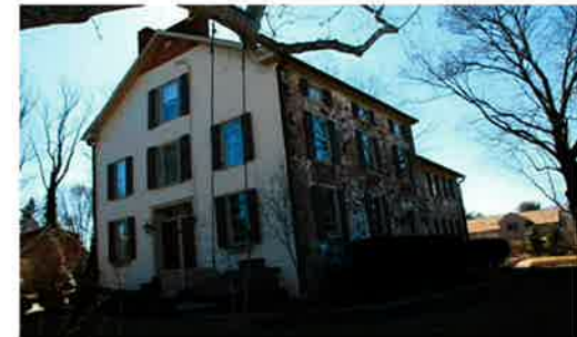
Gable end & street view