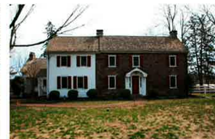
House front elevation