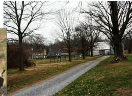
View of house & outbuildings from drive