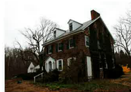
Front & side view