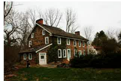
Rear view with stone addition