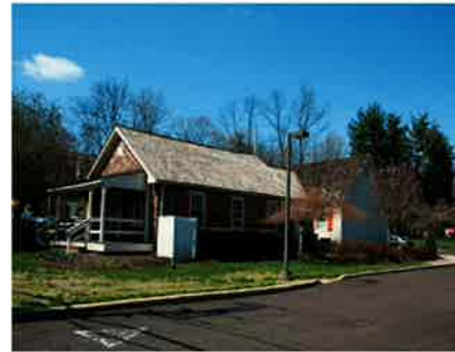
Side view with modern additions