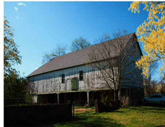
Barn with forebay