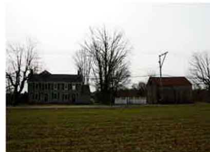
House & barn

Architectural Style Vernacular Materials Walls Wood frame Year Built c. 1860