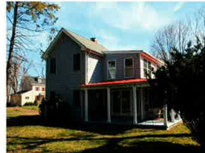
Side addition and rear porch