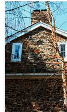
Chimney & datestone void