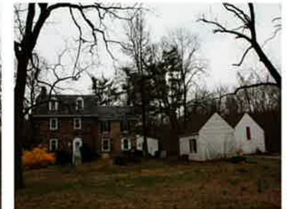
Rear elevation & outbuildings