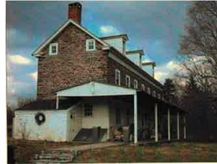
Southern facing view (photo from 2008)

County Bucks Municipality Upper Makefield Photo # 4 Tax Parcel # 47008047 Address / Location 1674 Wrightstown Rd. Resource Name Robert S. Trego Farm National Register Status Significant Historic District Ranking 2 Past Use Farm Current Use Residential farm Main Resource House Materials Walls Stone Year Built 1819 Architectural Style Vernacular