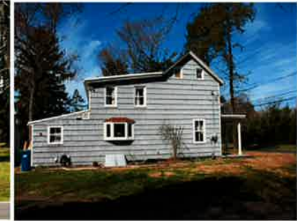
Side elevation (from driveway)