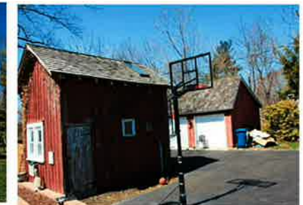
Shed & garage