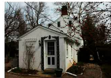
Front view (from driveway)