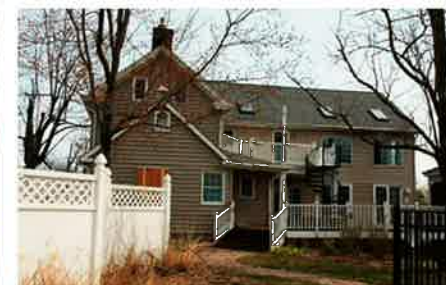
Side elevation (main block is at left)