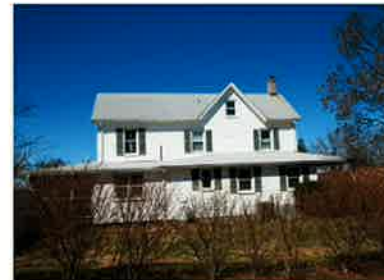
Side view with cross gable