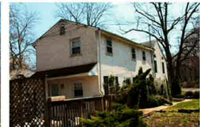
Stuccoed addition (street view)