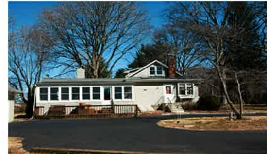
Side (driveway) view