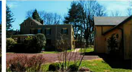
House & garage