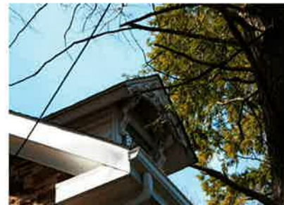
Detail of scrollwork