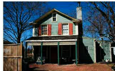
Original front entry for post office

Notes: Carriage house - like structure at in front yard, this is not historic.