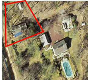
Site (house & springhouse highlighted)