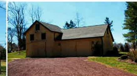
Garage / outbuilding