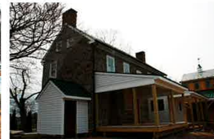
Rear view with new outbuilding

Notes: Main block: stone with small areas of stucco, 2.5 story, 5 bay, single pile, 2 brick interior end chimneys, gable roof. Addition: stone & stucco, 2 story, 2 bay, single pile, shed roof, extends from rear of main block. *Property is currently undergoing extensive alterations.