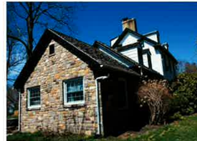
Additions to side of main block