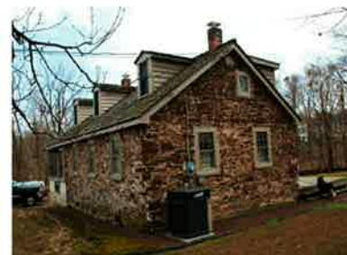
Main block (gable end)