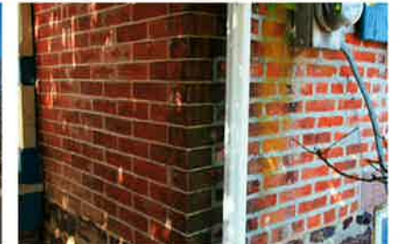
Brickwork (front & side)