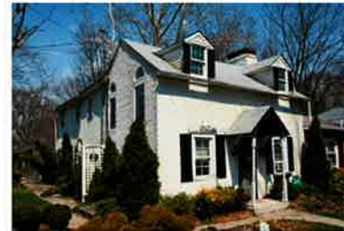
Main block with additions