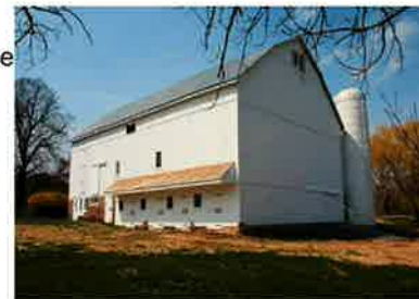
Wagonhouse, corn crib & barn