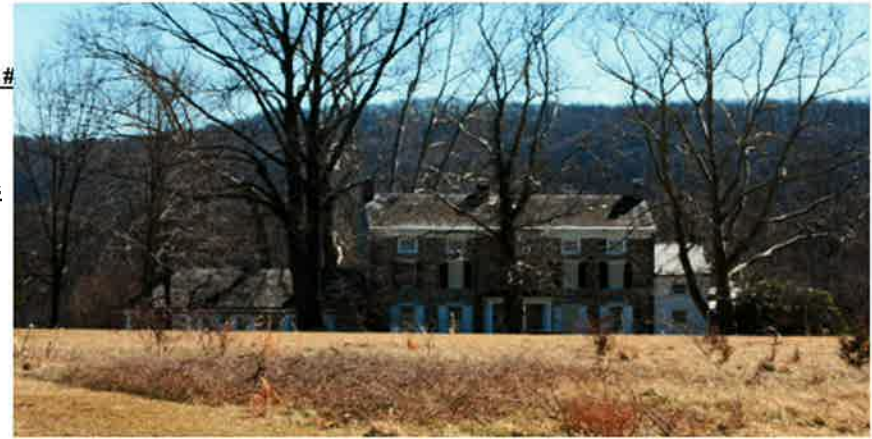
House (street elevation)

Notes: 3 part (4 bay, 4 bay, 1 bay). Gated, Limited Access.