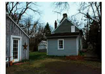
Garage & house