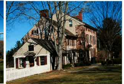
View from SE