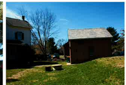
Barn & house