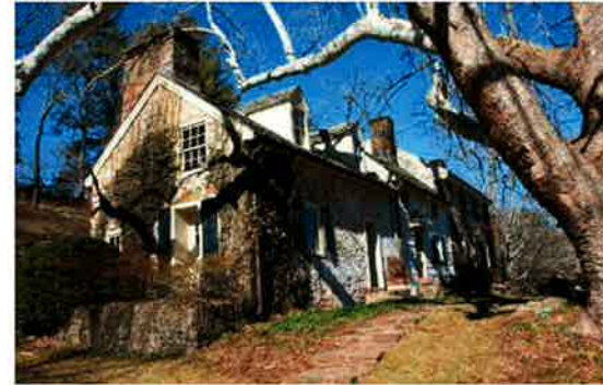
House (street elevation- from driveway)

Historical Notes: portion of house is a log structure possibly built by James McNair after c. 1760 purchase