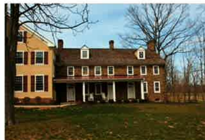
Front elevation of main block

Architectural Style Vernacular Materials Walls Stone Year Built 1817, 1844