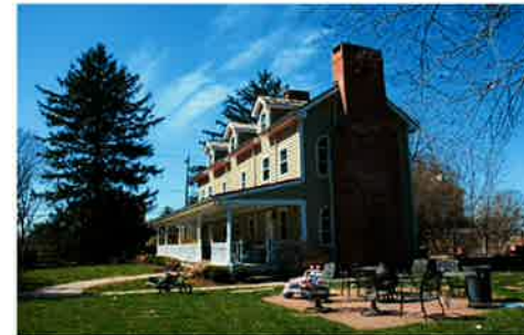
Front & side view