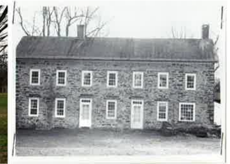
Northern elevation in 1990

Historical Notes: Robert S. Trego on 1859 map