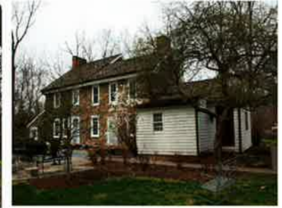
Rear view with frame addition