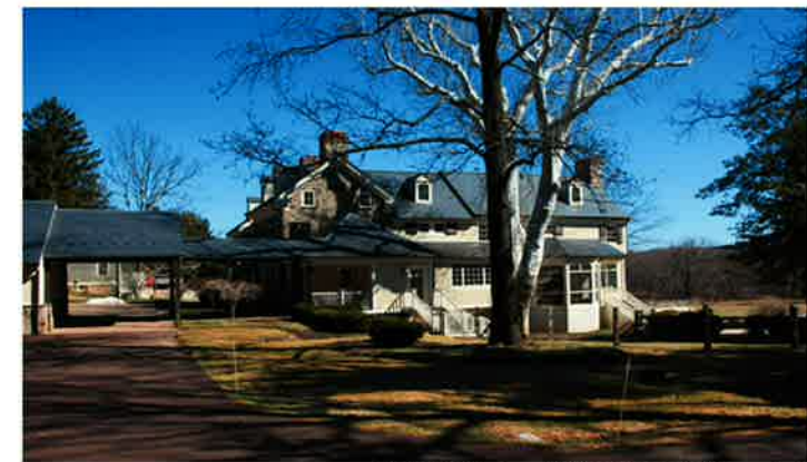
Driveway view with frame additions in fore