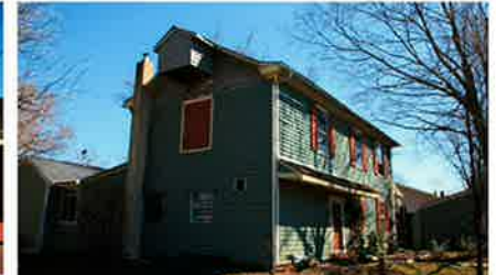
Goods loading area

Notes: Frame construction; 3 bay; 6/6; original entry on side (r); current entry on street facing elevation; pent roof above entry on left side of street elevation; goods loading bay on r side of building. 2 additions to rear built in 1990's and 2000's,