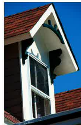
Detail of dormer