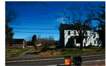
Main house & outbuildings