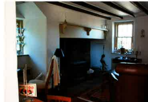
Cabin interior: cooking fireplace