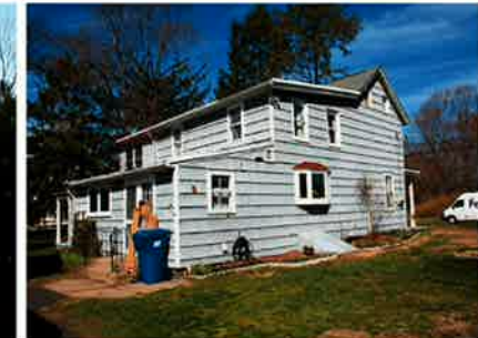
Rear and side