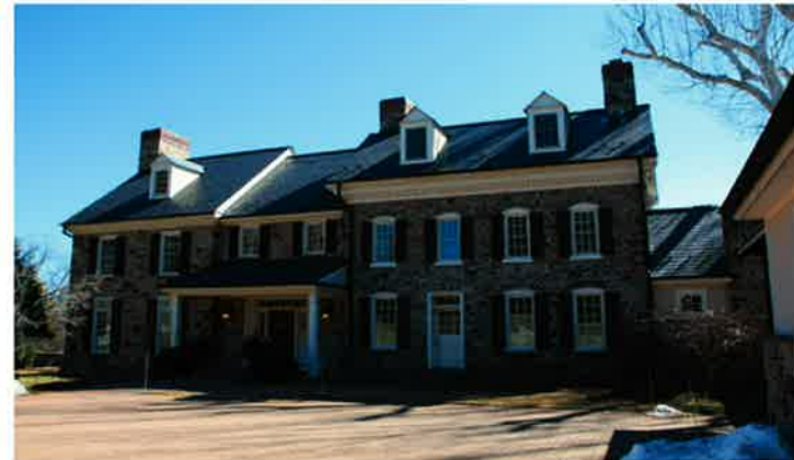
Main stone house

Historical Notes: One of the Atkinson Family Farms