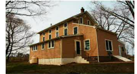
Springhouse & bridge