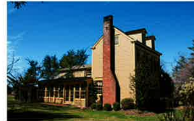
Street & side view

Past Use Residential Farm Current Use Residential