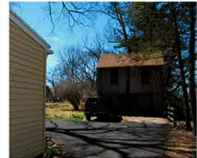
Barn / carriage house