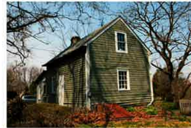
Main block & street view