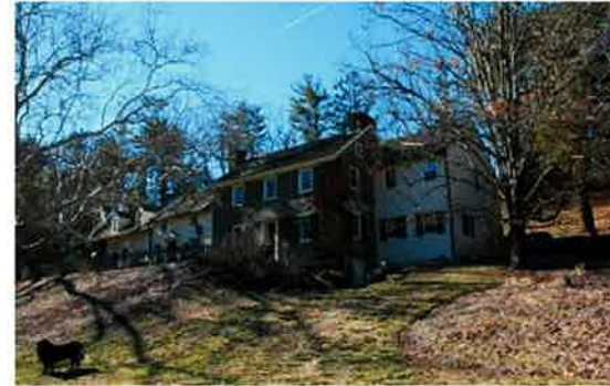
House (street elevation)