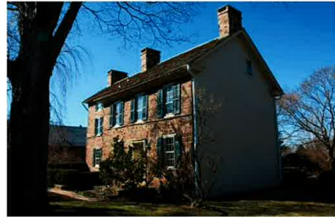
House (street elevation)