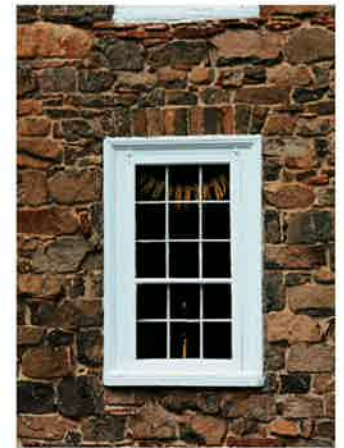
Jack arch over window