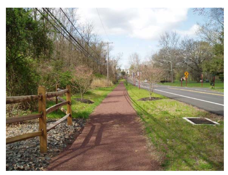
Photograph 7: Looking southwest from the new sidewalk along Washington Crossing Road at the same stormwater drainage grate and improved area around depicted in Photograph 6.