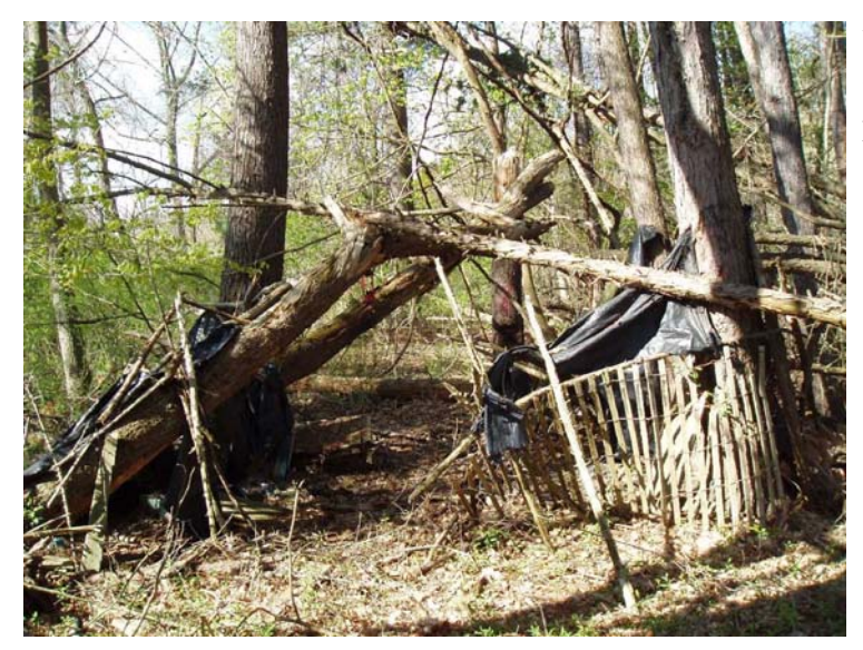
Photograph 3: Looking southwest at an old fort observed on the property.