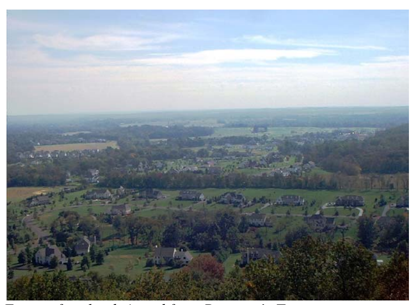
Former farmland viewed from Bowman's Tower

The acquisition of the farmland of the Floge property preserves one of the last open spaces between River Road and the Delaware Canal. The land between the canal and the river has also been preserved. The township's preservation of the Lehman, Buckman, and Rapuano tracts along Wrightstown Road has preserved long range vistas across the township into New Jersey. The agricultural views along the westerly side of Eagle Road were preserved with conservation easements on the Antrobus and Magill properties.