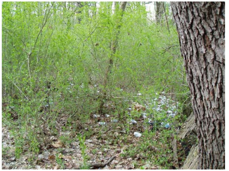
Photograph 5: Looking southwest at what appears to be an old party site with numerous aluminum beer cans remaining.