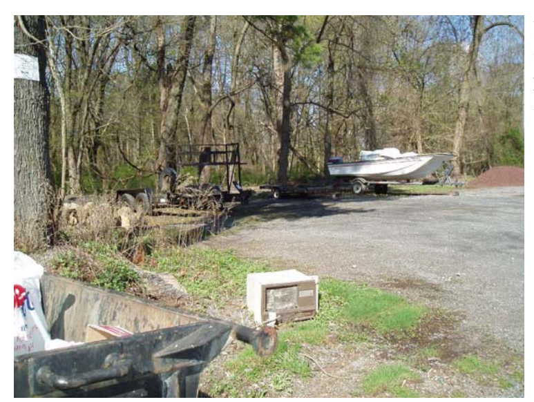
Photograph 1: Looking northwest at the southern portion of the stone parking/storage area along General Hamilton Road.

(See the enclosed Orthophoto Map showing the approximate location and direction of the photographs below)