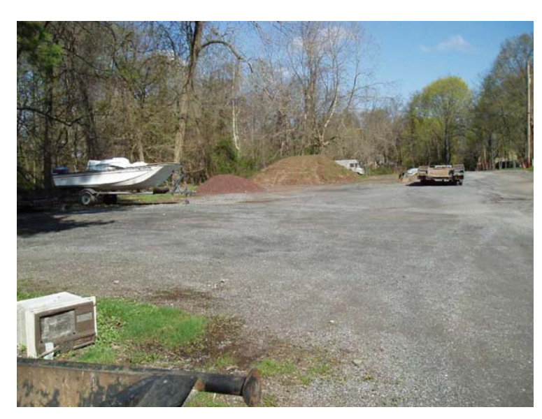
Photograph 2: Looking north northwest at the stone parking/storage area along General Hamilton Road.