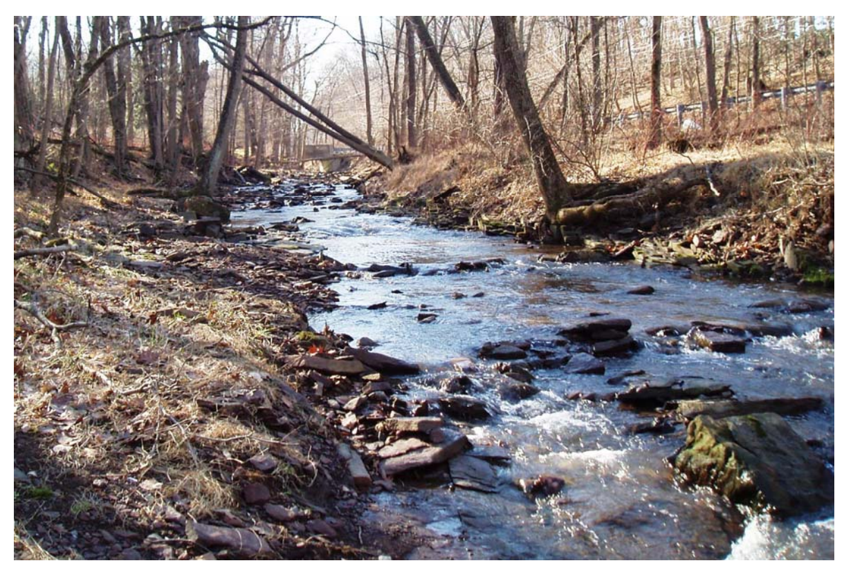
Preserved section of Houghs Creek