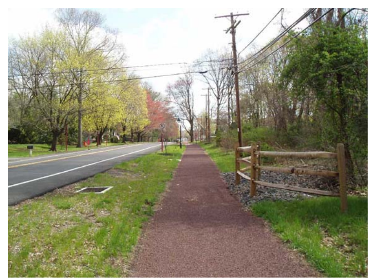
Photograph 6: Looking northeast from the new sidewalk along Washington Crossing Road at the stormwater drainage grate and improved area around the existing culvert conveying water under Washington Crossing Road and on to the preserved property.