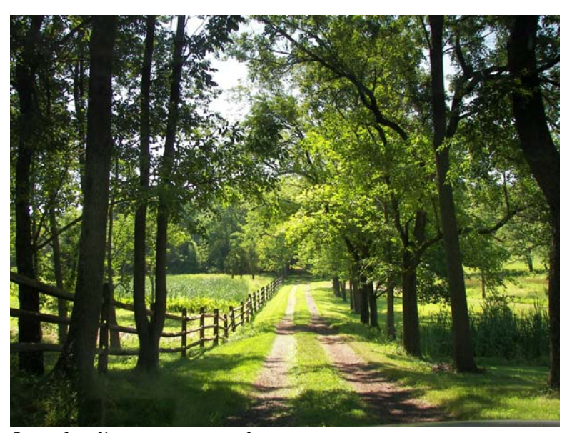
Lane leading to preserved property