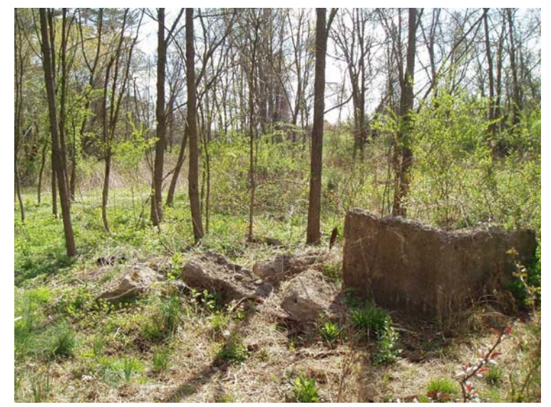
Photograph 4: Looking northeast at old, scattered debris observed on the property.